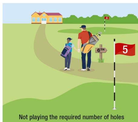
Not playing the required number of holes

Any scores being submitted for handicapping must be attested. You cannot play a round of golf without a marker and submit a score. This can be perceived as farming your handicap.