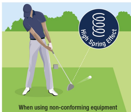
When using non-conforming equipment

When you play a round combined with a coaching session you cannot submit a score for the round.