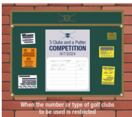
When the number or type of golf clubs to be used is restricted

At any time a non-conforming club is used during the round, the score is not acceptable for handicapping. E.g a spring effect driver