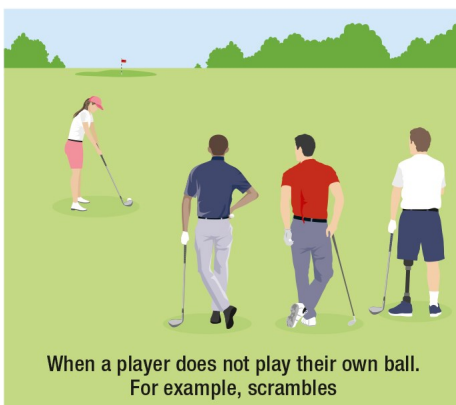
When a player does not play their own ball. For example, scrambles

For an 18-hole score to be acceptable for handicap purposes, a minimum of 10 holes must be played. For a 9-hole score to be acceptable, all 9 holes must be