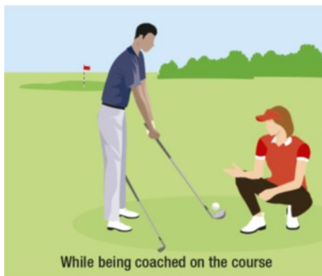
While being coached on the course

Some formats of play and scores played under certain restricted Terms of the Competition are not acceptable for handicap purposes. The following illustrative list is not exhaustive and if a player is in doubt as to the acceptability of a score, they should check with the Handicap Committee.